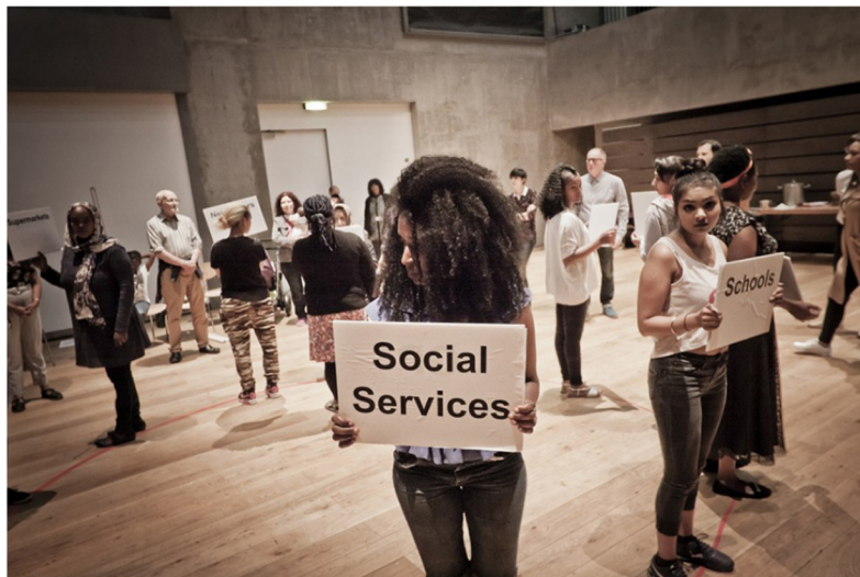
"V Nightingale", Implicated Theatre, 2015.