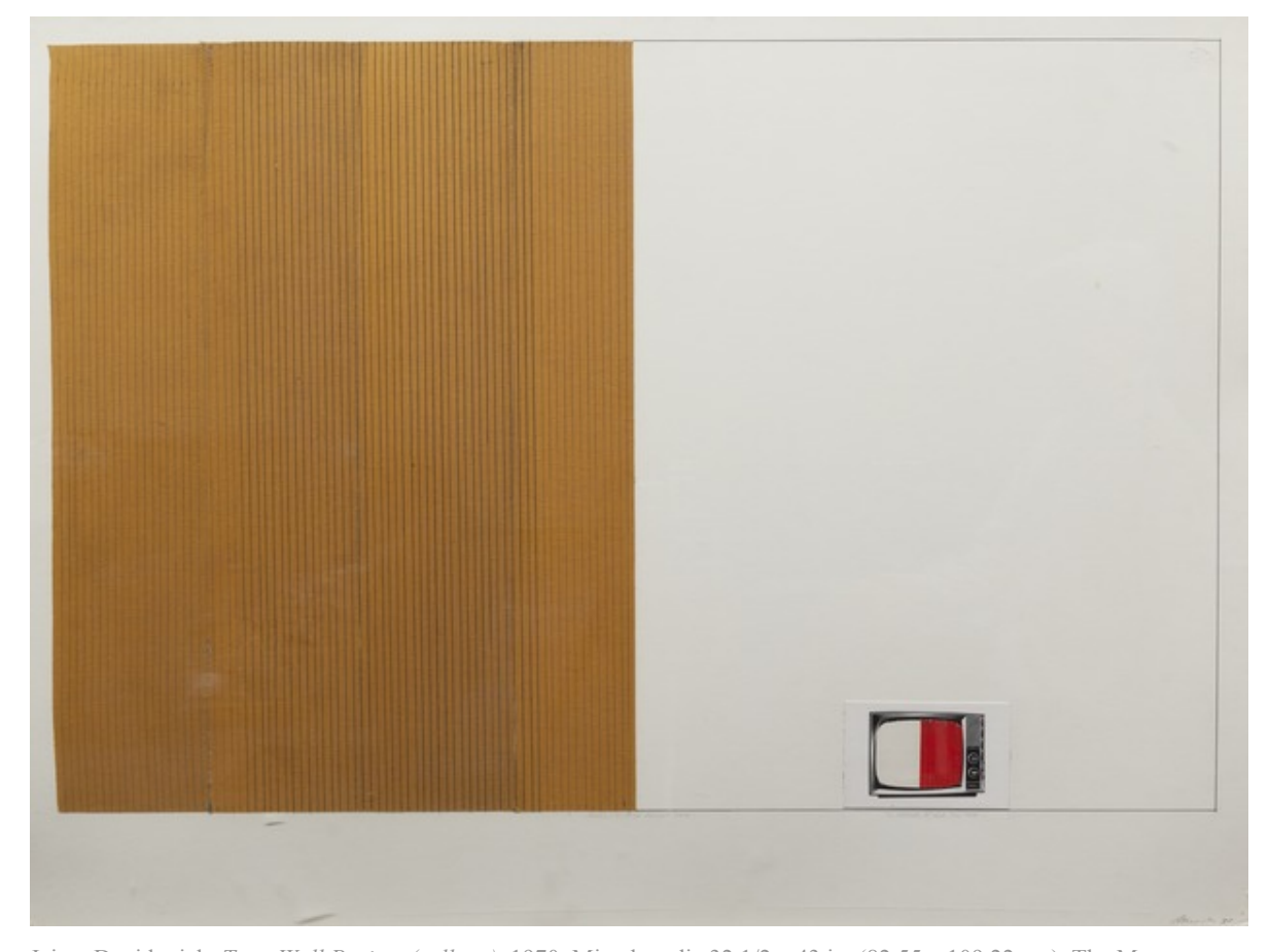
Jaime Davidovich. Tape Wall Project (collage) , 1970. Mixed media 32 1/2 x 43 in. (82.55 x 109.22 cm). The Museum of Modern Art.

AJ: So you spontaneously had this idea of taping half of the wall and then, on the other half of the wall, installing a screen that would show you doing the taping?