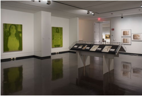
Installation view of Big Botany: Conversations with the Plant World at the Spencer Museum of Art, The University of Kansas

Recent artworks in the exhibition further emphasize the imbalances in our relationship with nature. Ackroyd & Harvey's sobering "Satanic Formula (after Senanayake)" (2017) stretches for several feet in the museum's sunlit atrium. Sunlight literally powers the piece; a thick, green carpet of sprouting grass covers its front. But etched in all that green is a scientific formula devised by Ranil