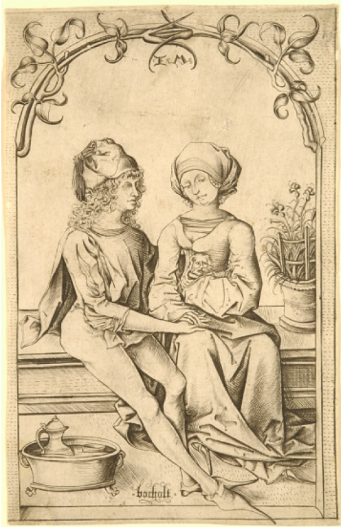
Israhel van Meckenem the younger, "The Lovers" (c.1470-1500), Spencer Museum of Art, The University of Kansas, Gift of the Max Kade Foundation

That relationship is examined throughout Big Botany: Conversations with the Plant World , an impressive art exhibition currently on view at the Spencer Museum of Art in Lawrence, Kansas. Timely and interdisciplinary, the show explores how humans have historically understood the plant world, and how we ought to reconsider it as we degrade the planet with greenhouse gases and ecological destruction.