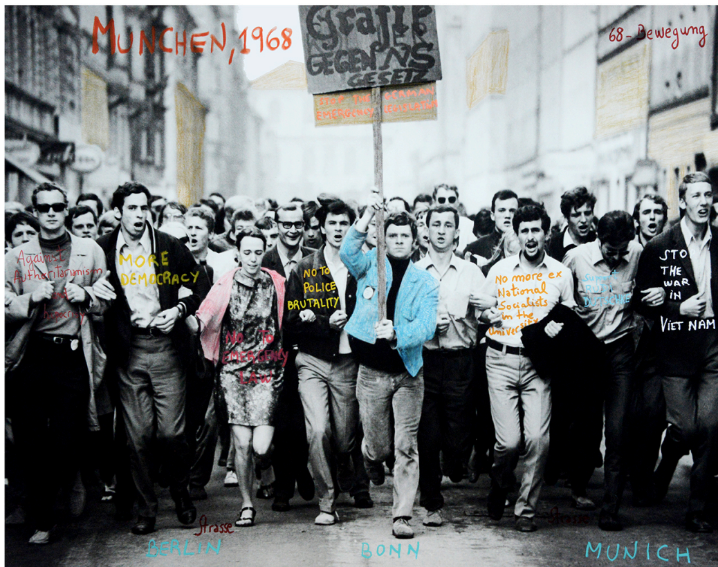
A wave of protests swept West Germany in 1968, in reaction against the emergency laws that the Government wanted to pass. Students also fought for more democracy and against authoritarianism.

In terms of the title, I was preparing the setup for the exhibition of 1968 in Henrique Faria Fine Art in New York with the gallerist and the gallery team, and so we chose to put the images on a wall with a fireplace. I thought of keeping the fire lit during the duration of the show, but that was not possible. So I decided to produce a video of fire and to place it in the fireplace. From there, the title came naturally: 'The Fire of Ideas'.