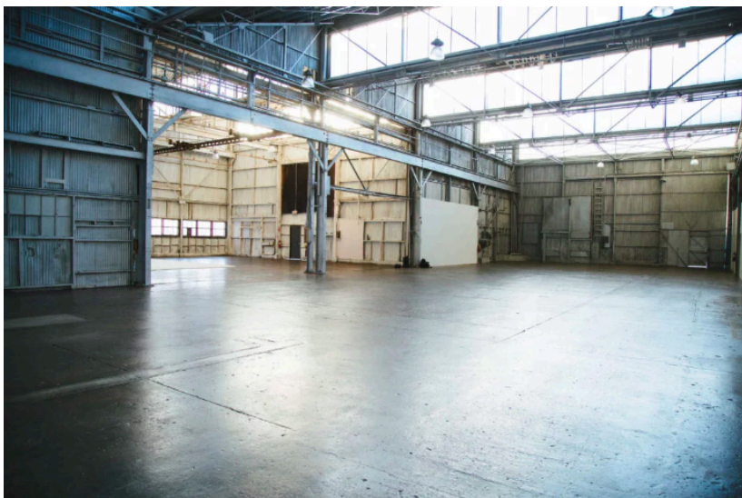
proyectosLA will take place in a former production warehouse.

The collaboration, called proyectosLA , brings 20 galleries from Central, South and North America to the city's Chinatown neighborhood. Participants range from big multinational outfits, such as Galeria Nara Roesler and Mendes Wood DM of Brazil and Henrique Faria of Buenos Aires and New York, to smaller outfits including Proyectos Ultravioleta of Guatemala and Instituto de Vision from Bogota, Colombia.