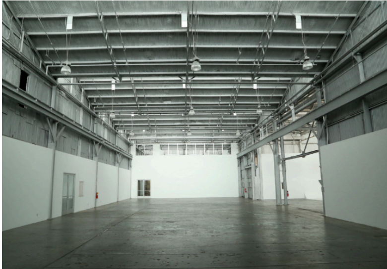
proyectosLA will take place in a former production warehouse.