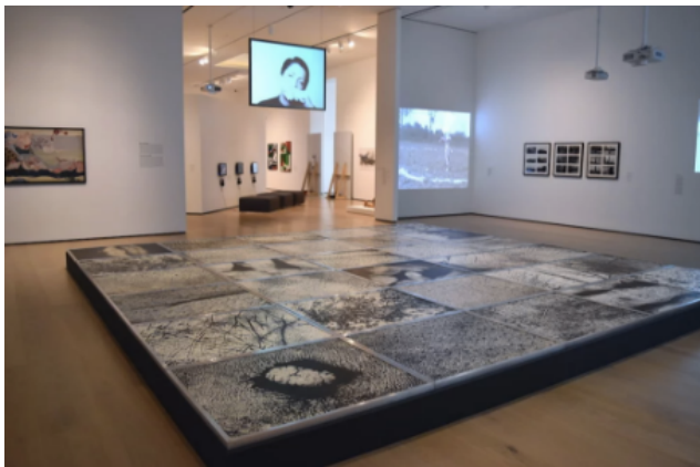
Installation view of "Radical Women."

Based on six years of research, "Radical Women" is a serious and scholarly show. And yet at the same time it feels like its own kind of crowd-pleaser. You don't have to choose between being smart and being popular if you're telling a story that feels necessary. And "Radical Women" has necessary stories to spare.