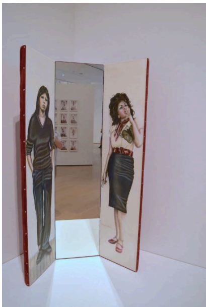
Judith F. Baca, Las Tres Marías (The Three Marias), 1976.