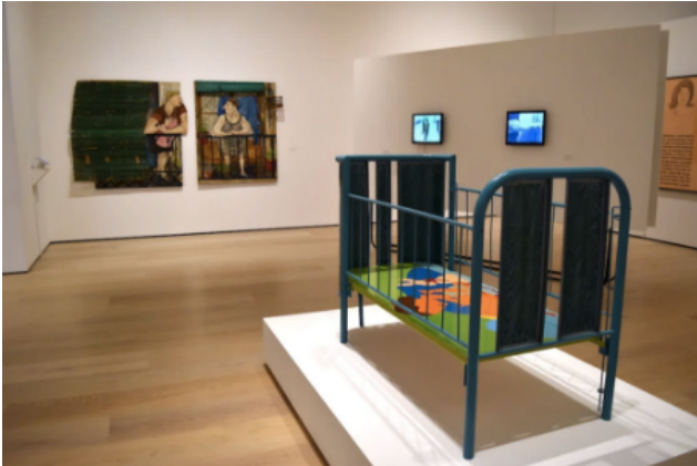
Installation view of "Radical Women."

I could go on—but, really, just go see the show if you have the chance.