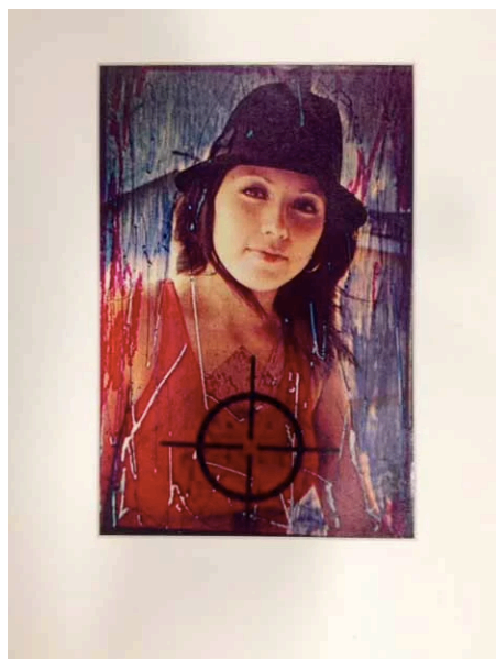
Isabel Castro, from the series "Women under fire" (1980). Collection of Isabel Castro. Artwork © the artist.

The show also includes a number of US-based Chicana or Latina artists, like the muralist Judith Baca and Patti Valdez (of the famed LA collective Asco), a decision that, the curators note, provoked some debate in the lead-up to the show.