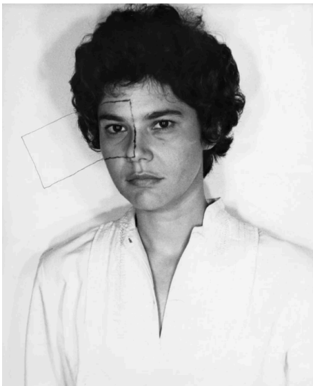
Lilliana Porter, Untitled (Self-portrait with Square) (1973). Courtesy of the artist. Artwork © the artist.

"Radical Women: Latin American Art, 1960-1985" at the Hammer Museum in Los Angeles, is not just a fantastic exhibition. It's the kind of exhibition that people always say we need more of—as regular as a ticking clock—every time the latest selfie-courting contemporary-art spectacular provokes a new spasm of anguish from critics about the decline of the museum.